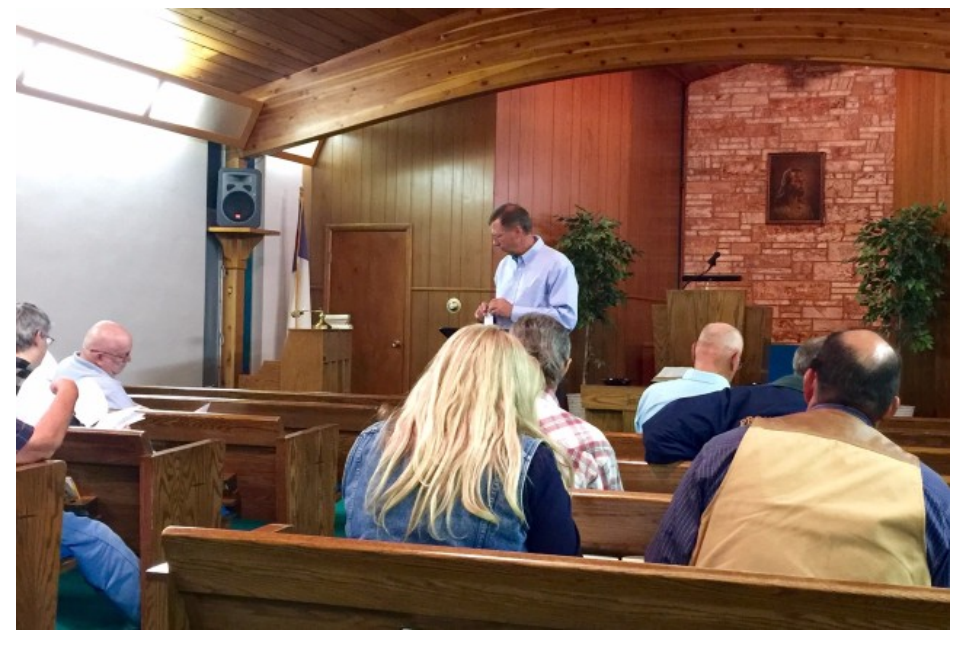
Five leaders from the administrative team of the Rocky

fresh new stories instead of outdated ones. Submission deadlines are Wednesdays by noon.