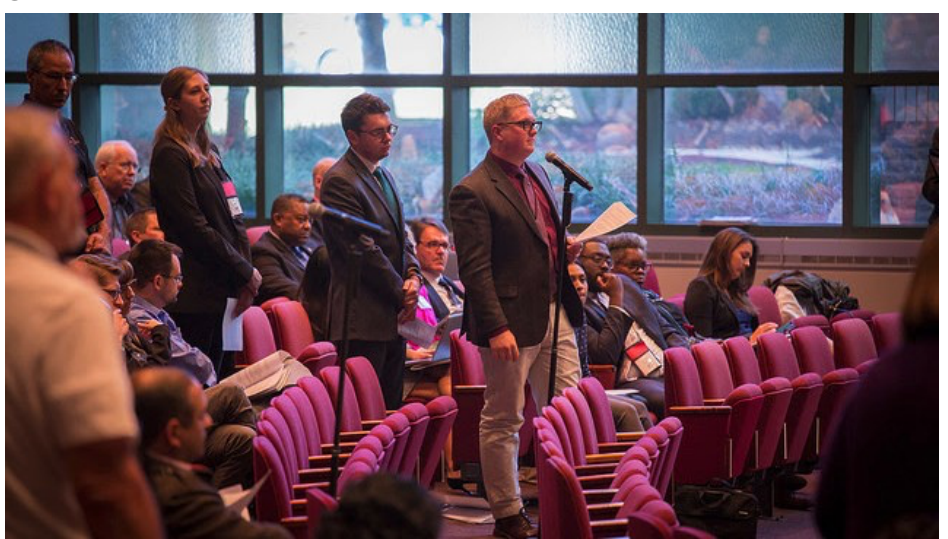
The first motion was made near the conclusion of the

Response to Unity in Mission document by NAD year-end meeting » After three hours of discussion, 2016 North American Division Year-End Meeting delegates voted on two motions pertaining to the General Conference (GC) Unity in Mission document. The discussion was broken into two segments, one on October 28; the second, on October 31.