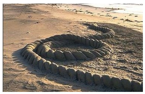
"When your promises and resolutions are like ropes of sand . . . you can give Him your will." -- Ellen G. White