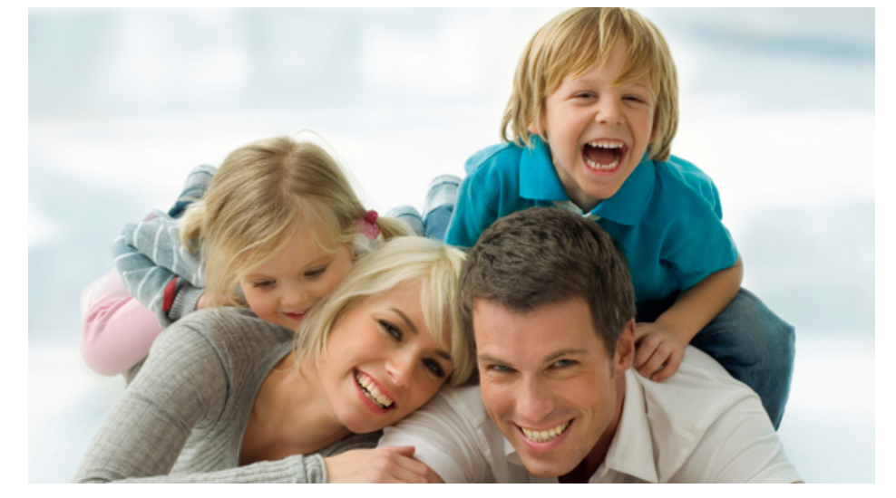
Ladies, are you looking for a way to start the year out right?